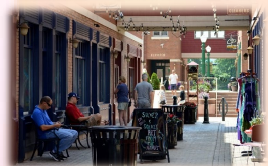
CHECK US OUT www.kentohio.org

YouTube: City of Kent, Ohio Follow us on Twitter, Pinterest, & Facebook!